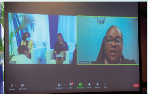
Members of the CUT participating in a virtual Regional Women's discussion